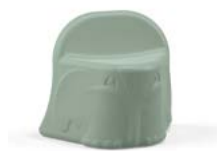
Chair Elephant shape

The Elle Series chair and table is a fairy-tale take on kids furniture for daycares, schools and other institutional facilities like a Behavioral Health or Corrections visitation areas that might be intimidating to children. We designed this series to be a safe product for use by children that can serve as a fun distraction in potentially stressful environments.